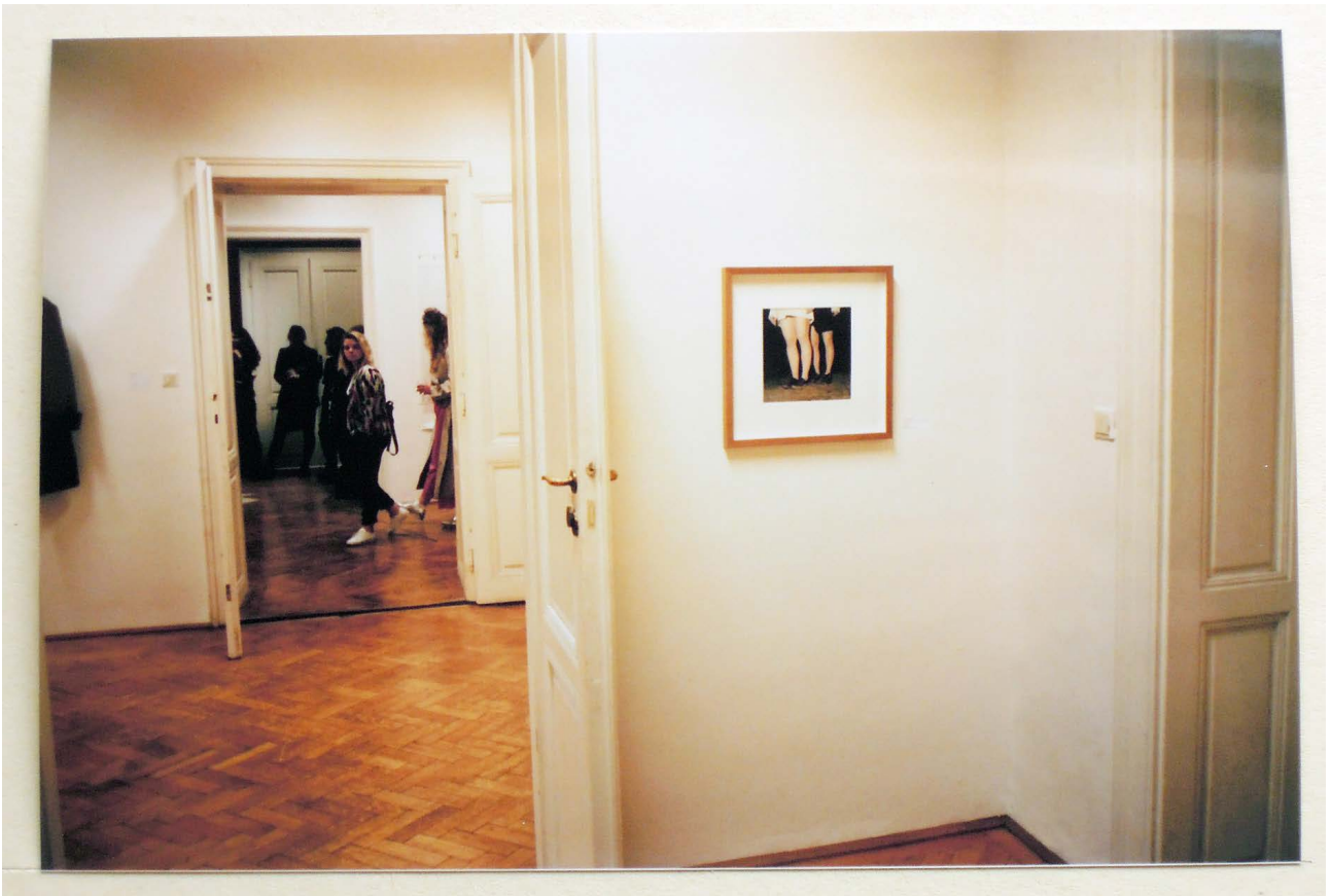
„A Conversation with the last white buffalo“ from the series „Portrait Unten“